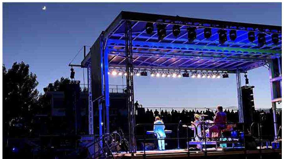
Approximately 2,000 concert goers attended the Imagine: Remembering the Fab Four Concert and Fireworks Show held on July 2, 2022 as part of Tooele City's week-long 4th of July celebration. Tickets to this event were only $5! This concert, and many others, are made possible by the Tooele City PAR (Parks, Arts, & Recreation) Program. Thank you to the people of Tooele City for supporting the Parks, Arts & Recreation program!